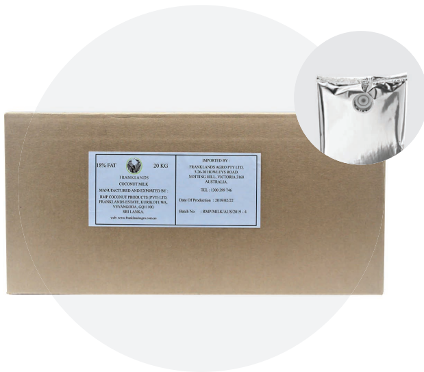
20kg bag in box (commercial bladder)

Available in both organic and conventional forms.