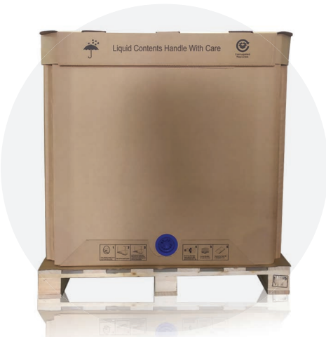
1000lt IBC Pallecon (with heat pad)