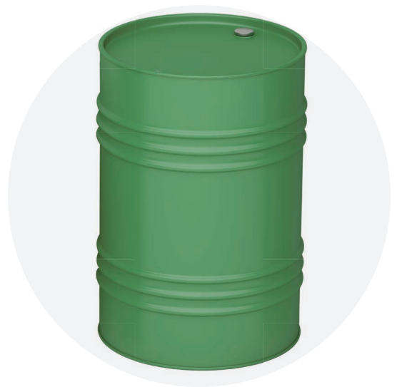
200kg UHT Drum