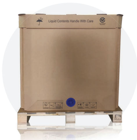
1000kg IBC Pallecon